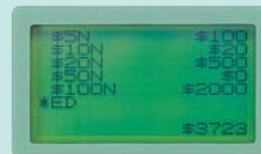
value by denominations newly issued (6 digit)

*Display shows bill count and amount by denomination.