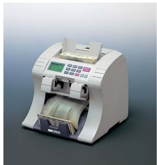
1,200 notes-per-minute speed counting.

Two communication ports for RS-232C can be installed for connection to devices such as personal computer, serial printer and cash settlement system.