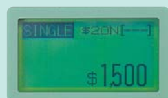
total value (7 digit)

Counts a specific denomination. Bills of a different denomination are fed to the pocket.