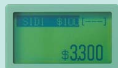
total value (7 digit)

Detects the denomination and orientation of the first bill, and counts only bills of the same denomination and orientation. Other bills are fed to the pocket.