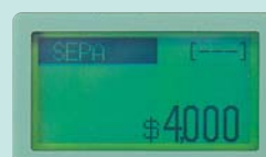
total value (7 digit)

Counts a specific denomination. When a bill of a different denomination is detected, the machine temporarily stops. When bills are removed from the stacker, counting resumes.