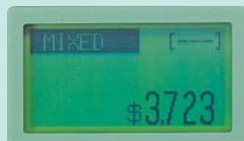
total value (7 digit)

Identifies and counts mixed denomination bills, providing an error-free summary of each denomination and/or the total count.